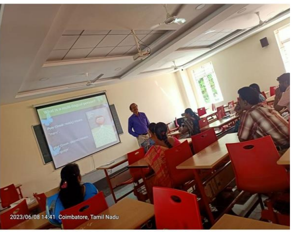
FACULTY DEVELOPMENT PROGRAME